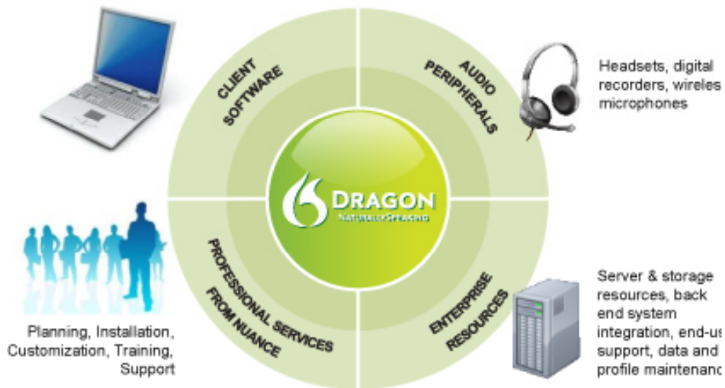
Figure 3: Components of a Dragon Enterprise Installation

In addition, setting realistic expectations has a critical impact on the success or failure of the speech recognition program. While speech recognition enables organizations to automate workflows without disrupting existing processes, there is still a component of change as employees adopt the new technology and transition to the new approach of dictation vs. typing. Professional services can facilitate the change management process, helping to speed and ease the organization's transition and drive higher user adoption rates.